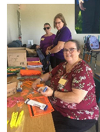
Community BBQ pictured above and packing school supplies to the left