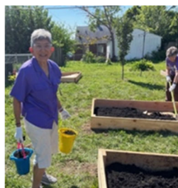
Working in the Community Gardens

PRAISE God! NWD LWML do- nates $10,000 to Camp Restore to buy a van! It will be put to good use!