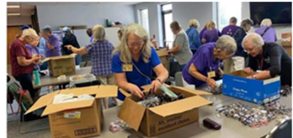
Sorting thousands of donated eyeglasses and finding that Special pair!

CHECK OUT LOTS MORE PICTURES ON OUR WEBSITE www.nwdlwml.org