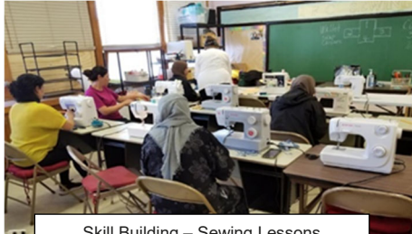
Skill Building – Sewing Lessons