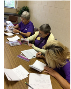
Assembling craft kits and writing cards of hope