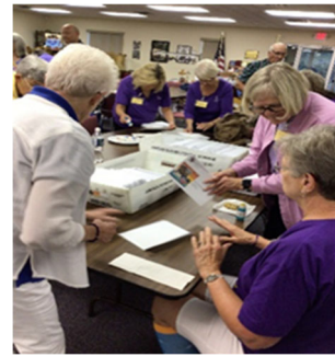
Willing workers putting together the 5,000 piece mailing!