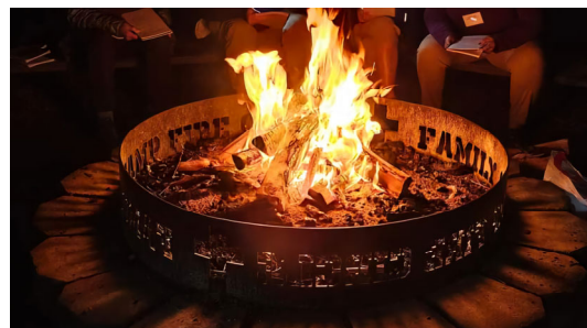
Ladies having fun making crafts and getting their nails polished pictured above, as well as the lovely campfire. Below is the beautiful group of the 107 retreat attendees!