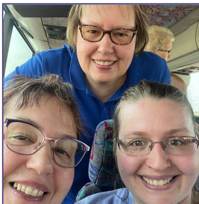
LWML Milwaukee convention 2023 is now a memory, but look at the smiles that were captured!