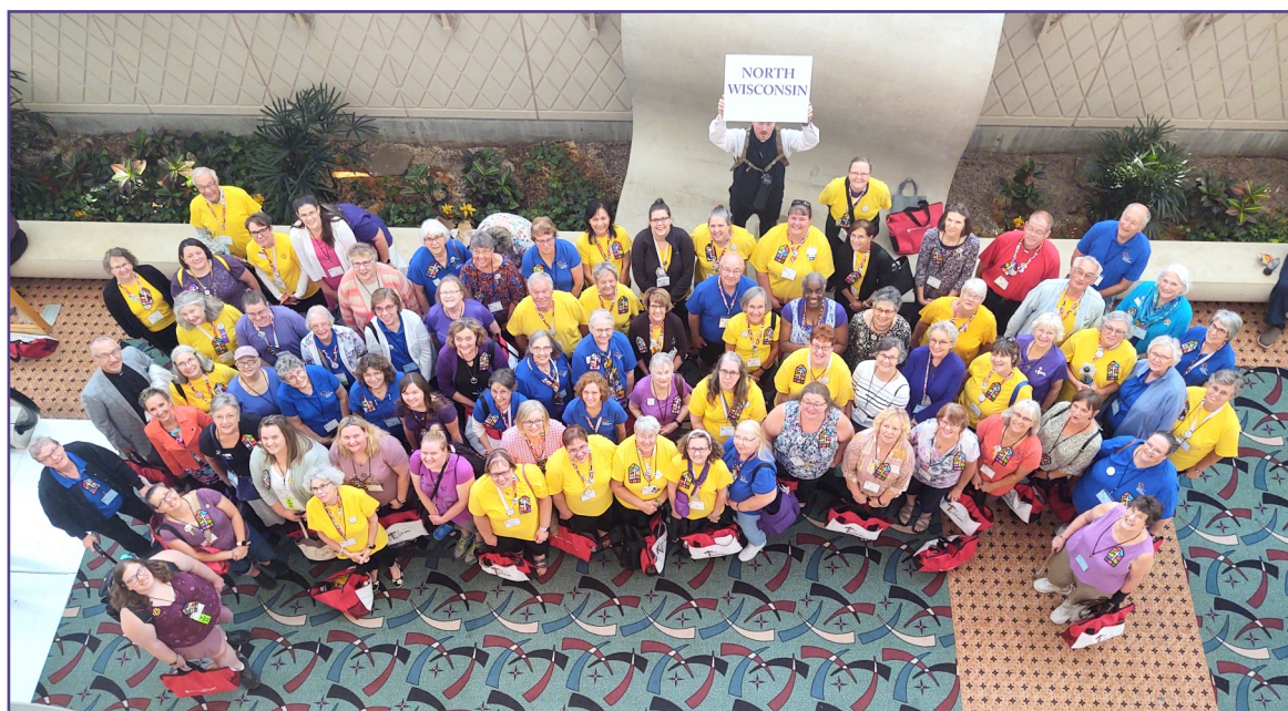
More than 3,500 people registered for the 40th biennial convention in Milwaukee on June 22-25. Yellow t-shirts identified more than 350 volunteers who helped with registrations, directions, worship services and a myriad of other duties. Above, following the North Wisconsin District caucus many of our delegates, volunteers and officers met for the group picture.