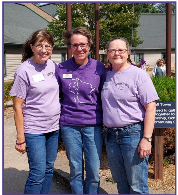
Zone 9 gathered by the Camp Luther Bell Tower.