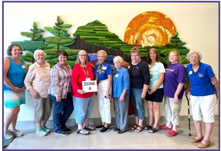
Zone 6 took this photo by the beautiful mosaic with names of donors in the entrance to the new Community dining center.