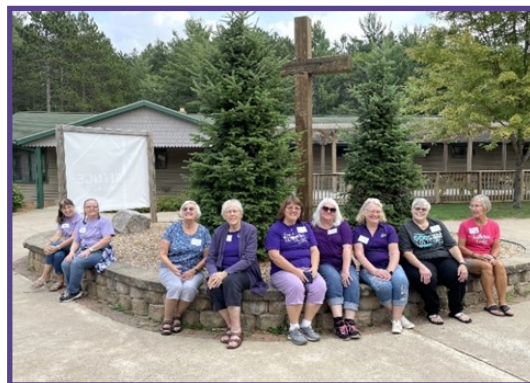
Attendees enjoyed the beautiful weather at Camp Luther

The Gifts from the Heart this year was for FORK (Feed Our Rural Kids). They are starting a food pantry at Three Lakes Schools this year. Just look at all the donations!