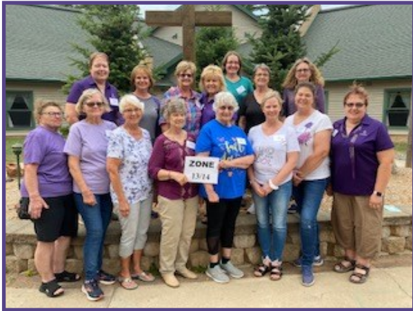
Above: Zones 13-14 chose an outdoor setting to pause for this photo.