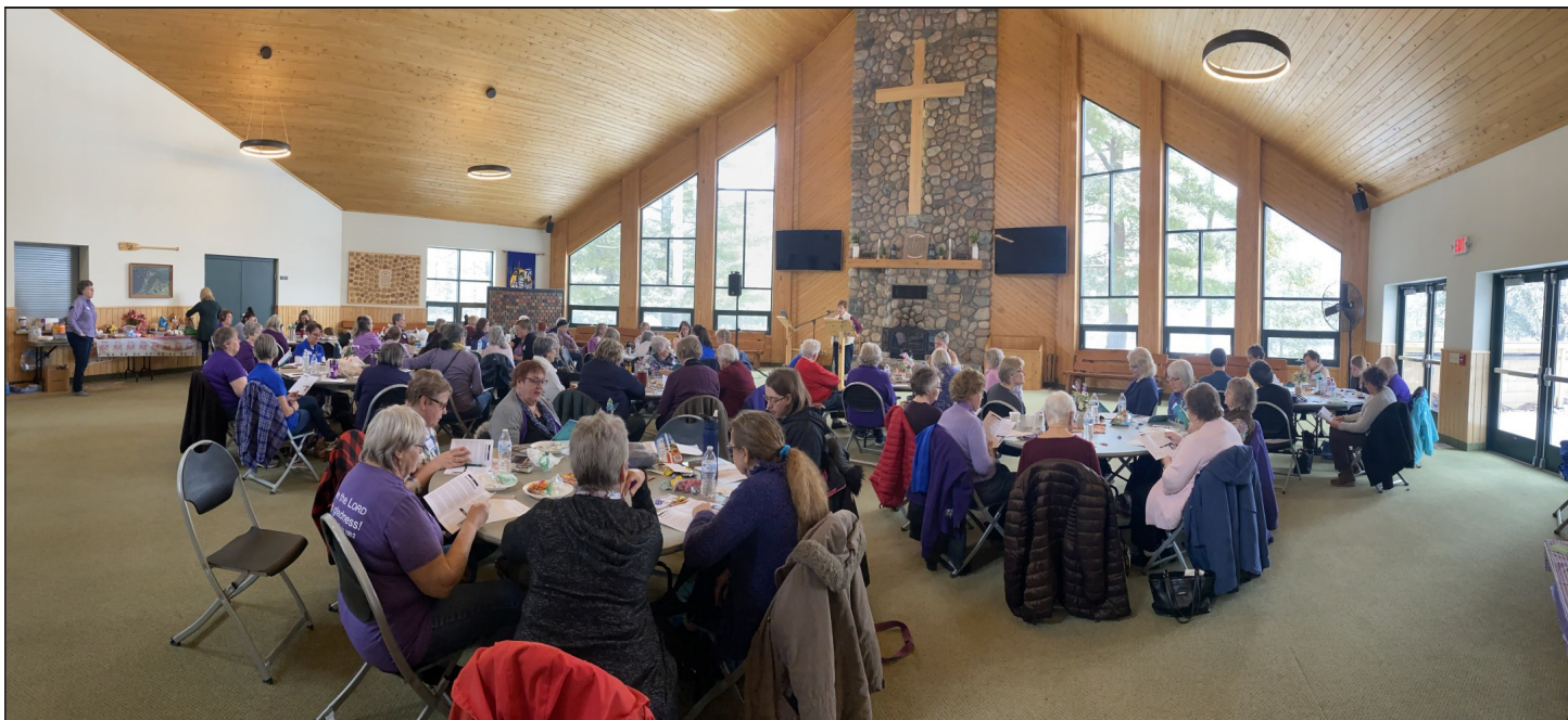
Exploring the first Bible study in "A Missionary? Me?"