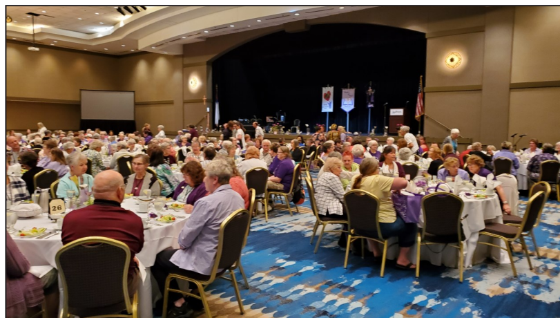
Friday Night, Banquet