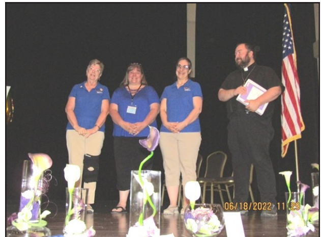
Installation of new officers