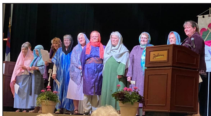
Above: Christian Life Leaders portray Women of the Bible Left: President's Reception