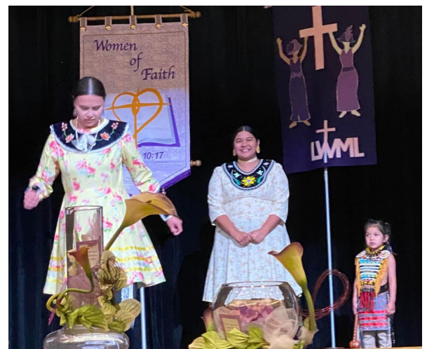
Oneida Dancers, Banquet Entertainment