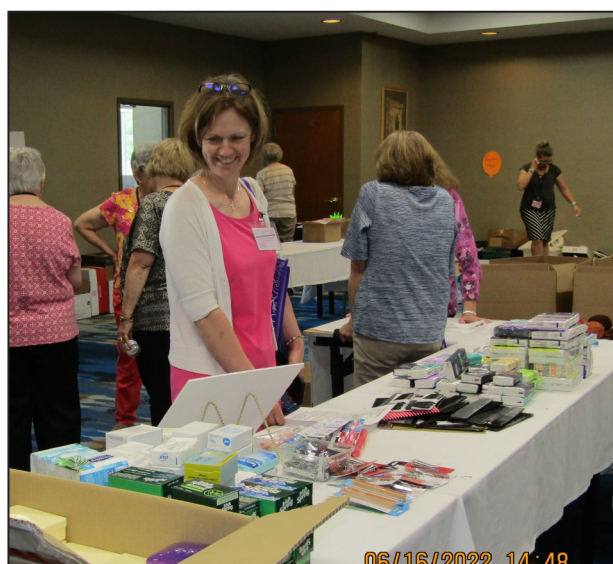
Gifts of the Heart