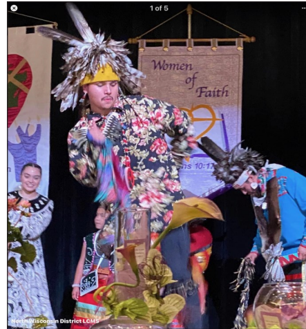
Oneida Dancers Banquet Entertainment