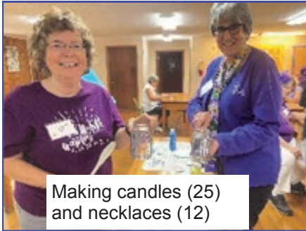
Making candles (25) and necklaces (12)