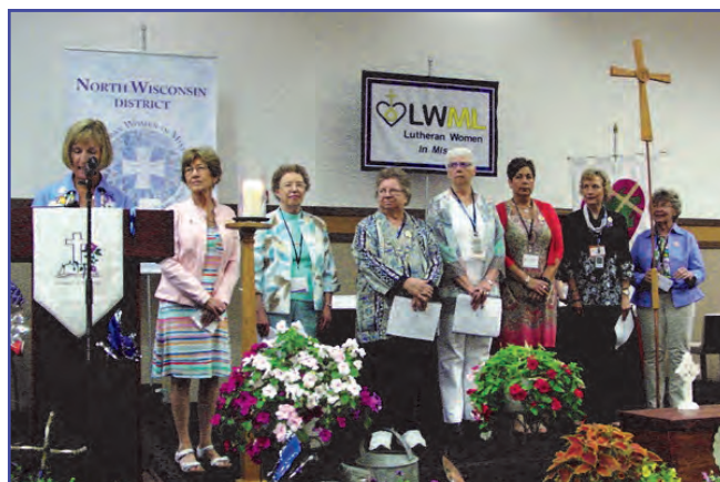
Past District Presidents led the League Pledge.