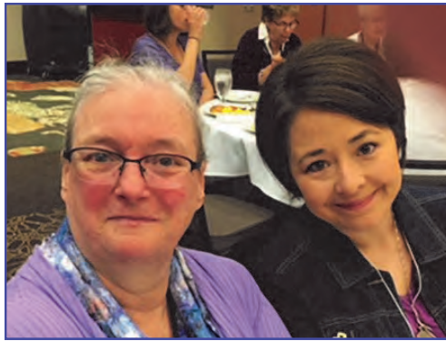
Breakfast with YWR, H2H, mentors and guests.