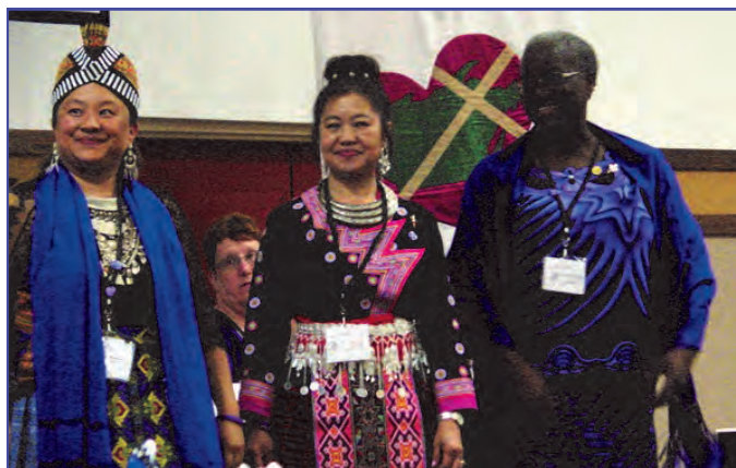
Heart to Heart Sisters wore beautiful traditional clothing.