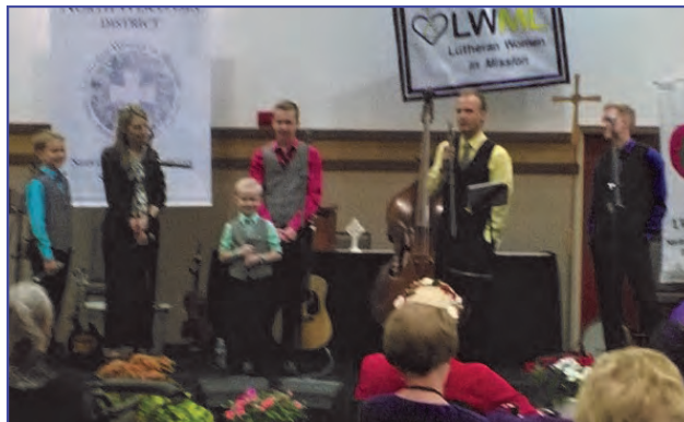
The Benson Family Singers provided entertainment after the wonderful banquet celebrating NWD 75th anniversary.