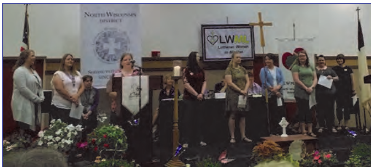
2018 Young Women Representatives