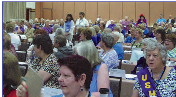
Opening processional of District Board personnel, YWRs and Heart to Heart Sisters.