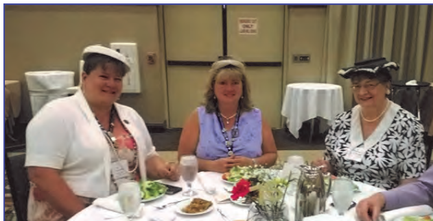
Many women enjoyed wearing vintage hats and clothing, plus having gloves and purses to celebrate.