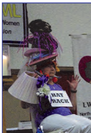
The Christian Life devotion showed us the many, many hats we wear that will be replaced with a golden crown.