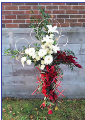
Left: Floral arrangement shows the rainbow with its vibrant colors.

Right: The first tells of what Jesus did for us. The red depicts the blood and suffering of Jesus to make us "white as snow" (purifies us).