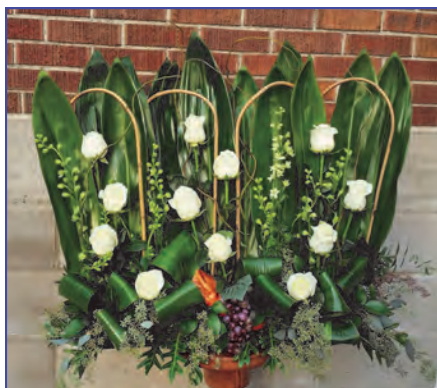
arrangement depicts the Lord's Supper. The white roses show us the purifying we receive with the grapes and bread.

The second part of her presentation was from a mission trip she took to Tanzania, Africa, for Soles for Jesus. They gave shoes to people from three different villages. The way to one of the villages was not vehicle friendly so they set up under the only large tree around and they could watch the people walking barefoot toward them to get their shoes. The Ingathering for our Rally was shoes and we gathered well over 150 pairs.