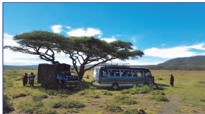
The bus that transported the mission team and the truck that transported the shoes.

The second part of her presentation was from a mission trip she took to Tanzania, Africa, for Soles for Jesus. They gave shoes to people from three different villages. The way to one of the villages was not vehicle friendly so they set up under the only large tree around and they could watch the people walking barefoot toward them to get their shoes. The Ingathering for our Rally was shoes and we gathered well over 150 pairs.