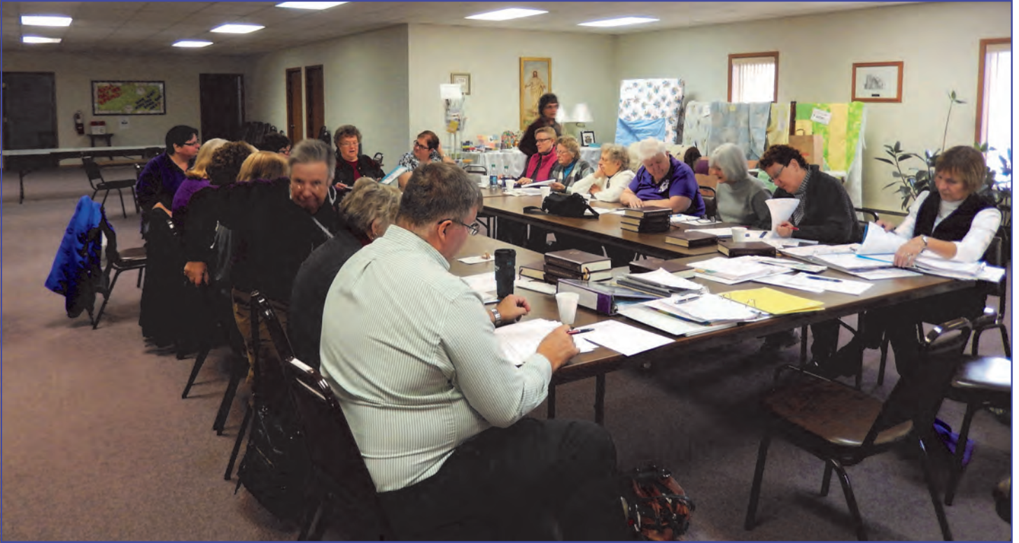
Planning Meeting for 2018 District LWML Convention